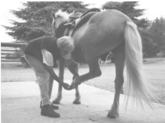
Photo 8: To help increase range of motion you can bring the hind leg forward - support the leg up with the inside hand on the underside of the fetlock joint and the other hand on the bottom of the hoof. Circle the leg in both directions without "stretching" the leg - move within the comfortable range of motion. Take care of your back by supporting your outside elbow on your upper leg as you move from your feet to make the circle rather than from your arms.