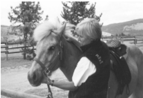
Photo 3: With one hand supporting the chin and the other hand on the crest, invite the nose to come forward and open the throatlatch. Remember less is more.