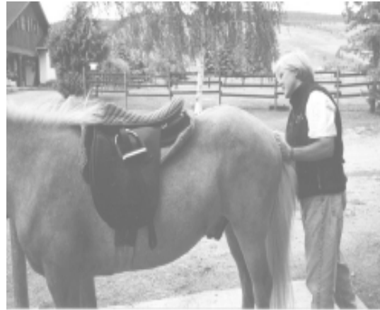
Photo 10: Pelvic tilt: place a hand on the buttocks on either side of the tail. Moving from your feet, press gently into the buttocks, pause and then slowly release. This helps move the sacrum and round the back. Move your hands down the buttocks a few inches and repeat. Watch for your horse's response and do less or from just one side if your horse shows concern or moves.