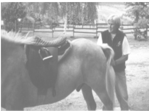
Photo 9: Make a curve in the tail with one hand under the tail, lifting up, and the other hand on the outside of the tail. Circle in both directions.