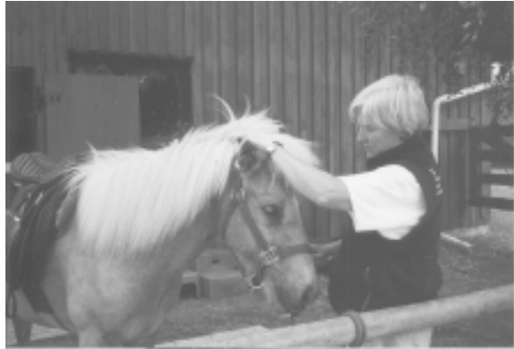
Photo 1: Use about 30 seconds of ear strokes as a way of lowering the head to relax the topline. One hand is on the nose band of the halter as the other hand strokes from the base to the tip of each ear.

Many people think they don't have time to do TTEAM work with their horses. Even five minutes of TTEAM work before mounting provides a warm-up and can make your ride more pleasant for both you and your horse.