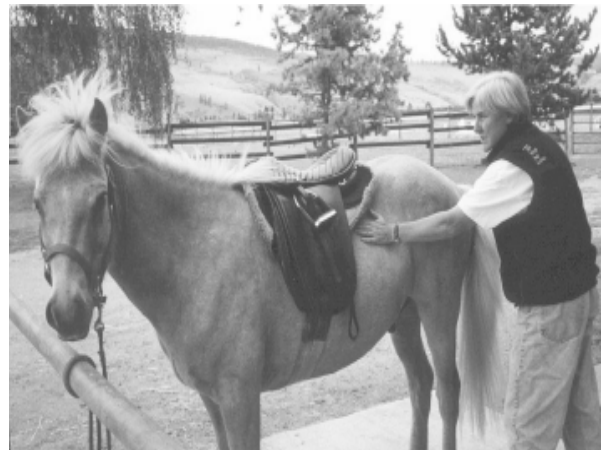
Photo 11: Rib releases help to extend the ribs on the opposite side from where you are standing and encourage lateral flexibility. With one hand on the tailbone place the other hand on the ribs. Think of doing a slight lift of the skin diagonally towards the ribs as you bring the hindquarters in your direction with the tail. Pause and then slowly release. It is on the release that you will notice there has been a slight flex. Repeat on the other side.

You may choose to do some or all of these exercises before riding. Notice if there are any differences in your horse's behavior or warm-up time after you mount.