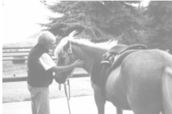
Photo 4: One hand on the nose and the other does a few circles along the neck vertebrae as you ask his head to bend in each direction. Ideally the head should come back without just tipping the nose.