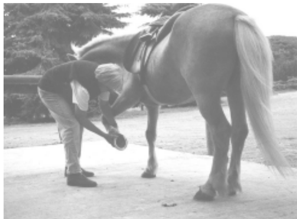
Photo 6: Leg exercises can be done during hoof cleaning or once the saddle is on. Support the fetlock joint with your inside hand and the hoof with the outside hand. Move the leg, in towards the other front leg, back, out to the side and forward several times in each direction at various heights. This will free the shoulder and back.