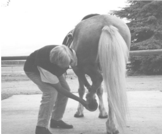
Photo 7: The inside hand supports the cannon bone and the outside hand supports the hoof. Circle the hind legs, several times in each direction, even with the other hind leg, at whatever height is comfortable