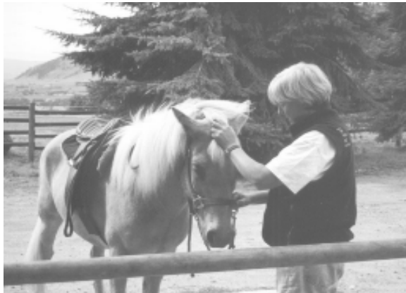
Photo 2: Circle the forelock and gently press your hand on the forehead directing the focus towards the horse's tail and then gently bring the focus forward. This affects the poll, neck and back.